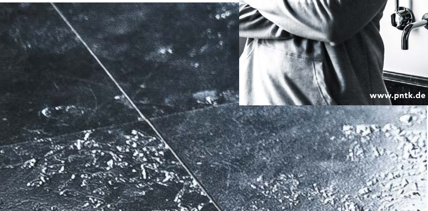
Blue Stone of Hainaut - EnoPasso®